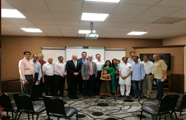
Hindu Mandir Executives' Conference Sept. 15-17, 2017 Indianapolis, IN