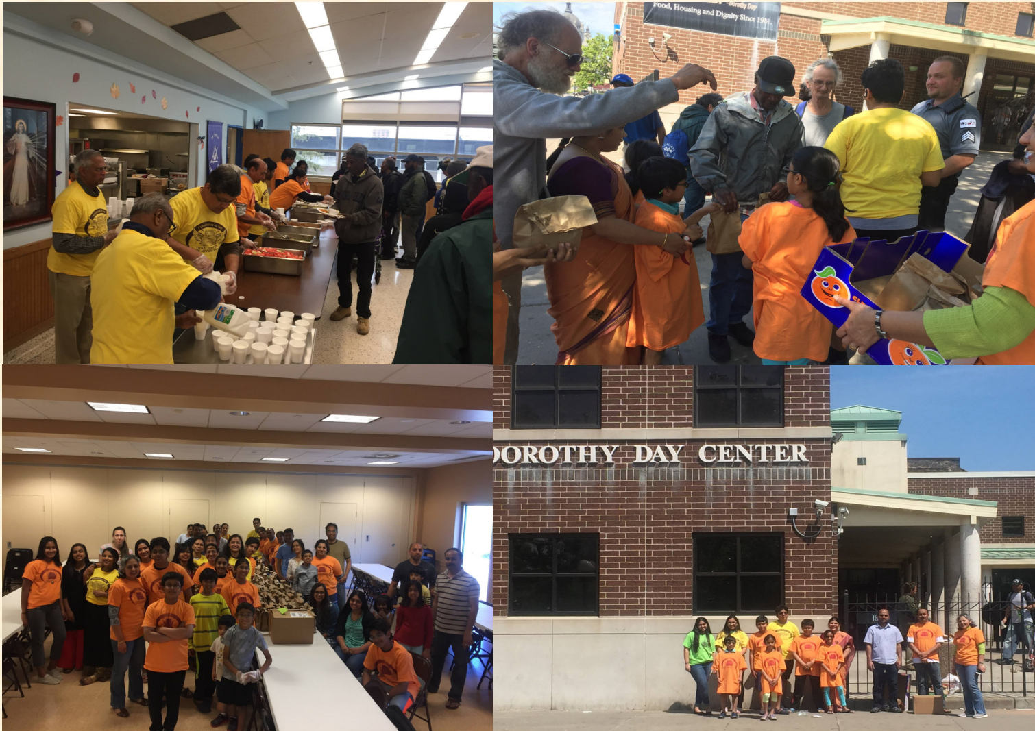
Hindu Mandir Executives' Conference Sept. 15-17, 2017 Indianapolis, IN