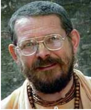
Swami B A Paramadvaiti