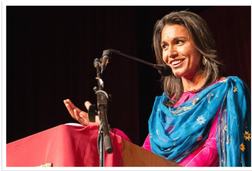
Congresswoman Tulsi Gabbard (D-HI), 9/14/13

“ The work that is being done is affecting people's lives... It's not only empowering Hindus across the country and around the world to be proud Hindus, to worship in a free society...but it is also educating the greater population about truly what it means to be a practicing Hindu. ”